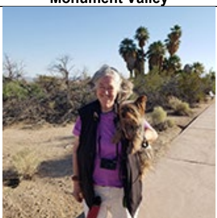
Joshua Tree National Park