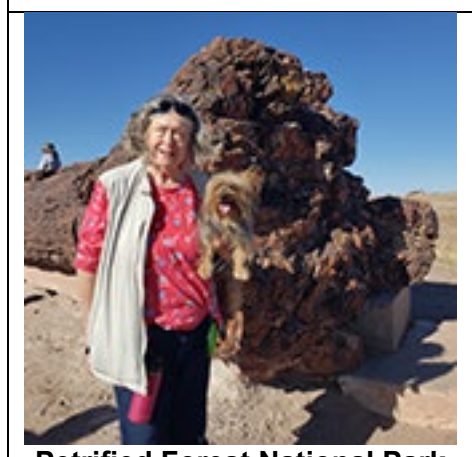
Petrified Forest National Park