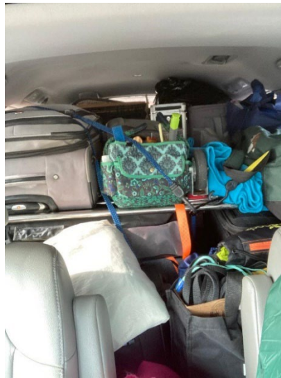
From the front of the van .