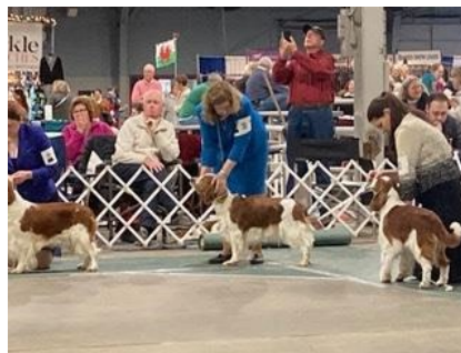
Serry being stacked for judging.