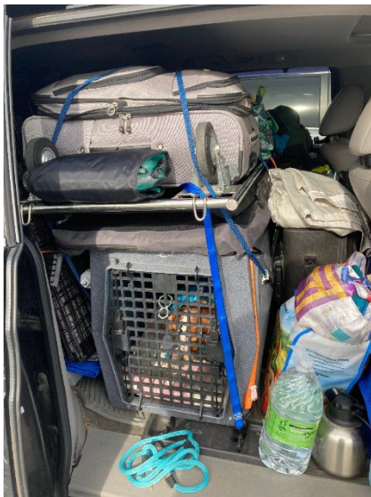
Claire packed in.